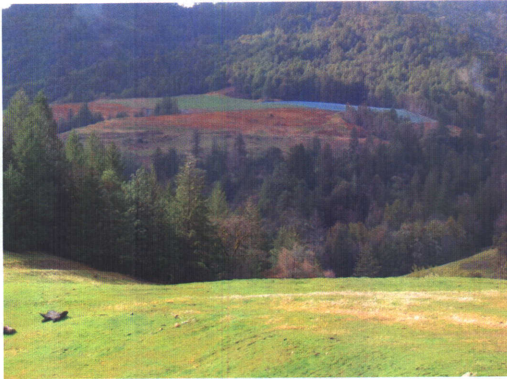
Proposed Place of Use (existing vineyard in background)