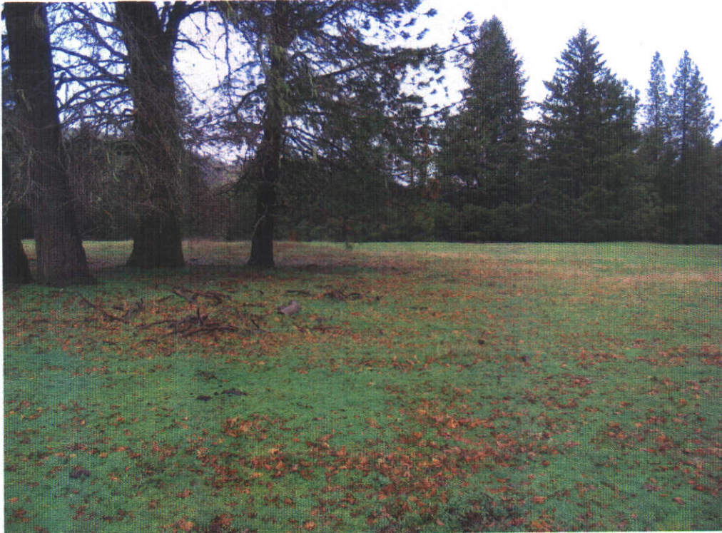
Proposed Place of Use