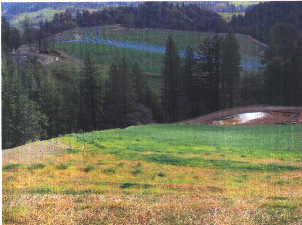
Proposed Place of Use (existing vineyard in background)