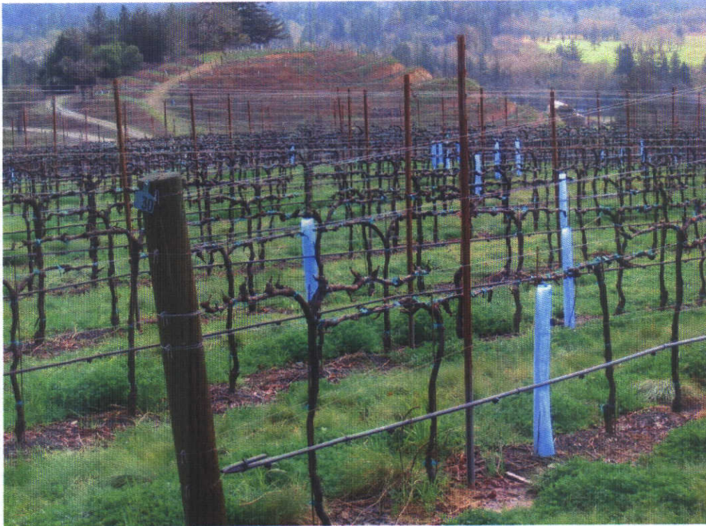
Proposed Place of Use (existing vineyard)