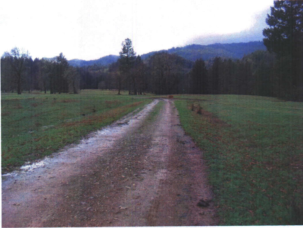
Proposed Place of Use