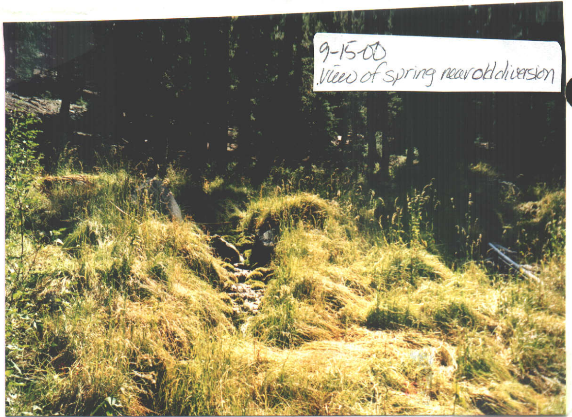
9-15-00 View of spring near old diversion