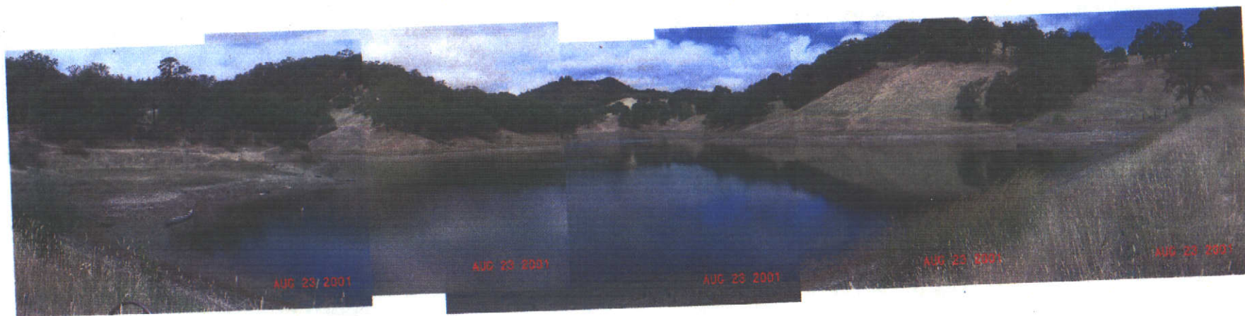
Round Mountain Reservoir viewed from the dam.