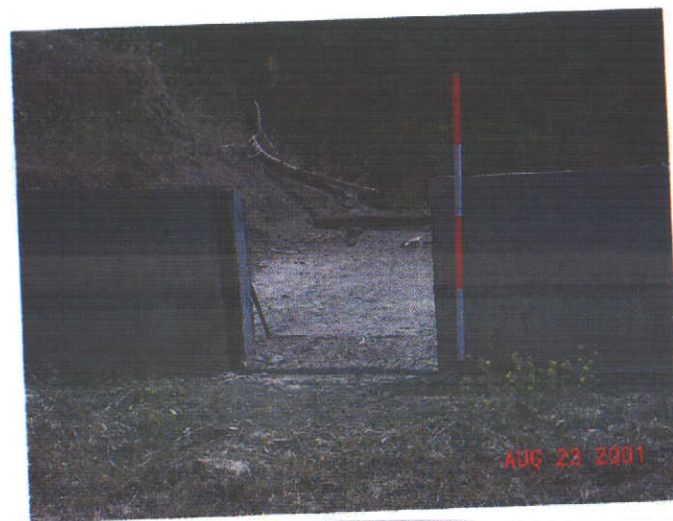
Spillway in the dam at the "Back" Reservoir.