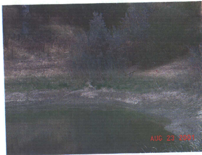
The upper photographs show the sump looking north from the dam. The lower photograph is a close up of the the bank where runoff concentrates in the ravine and flows into the sump.