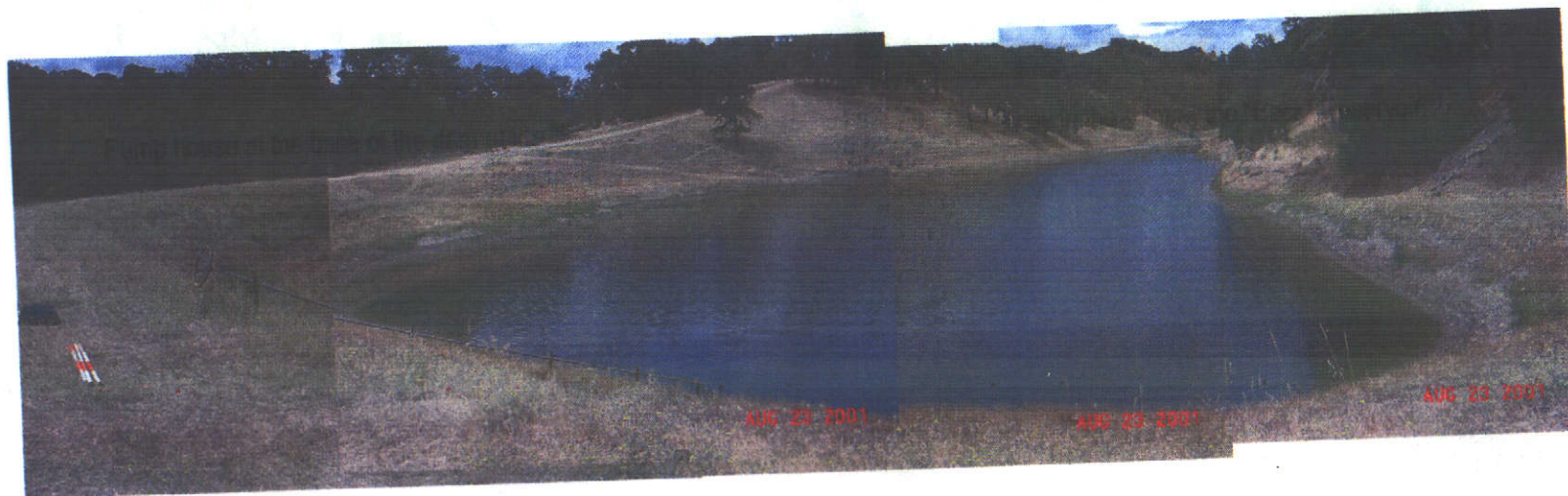
The "Back" Reservoir viewed looking Northwest from the dam.