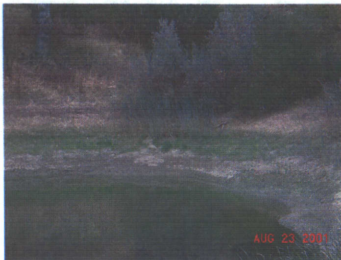
The upper photographs show the sump looking north from the dam. The lower photograph is a close up of the the bank where runoff concentrates in the ravine and flows into the sump.