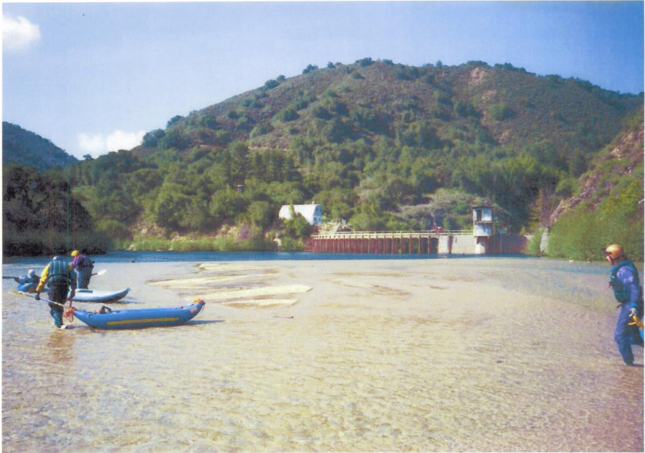
Looking downstream from the reservoir toward the spillway and the upstream face of San Clemente Dam – outlet tower is to the right of the spillway (May 2002)