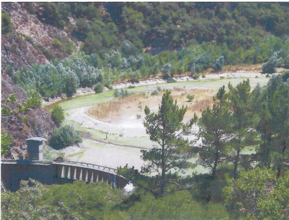
Looking upstream across the crest of San Clemente Dam – outlet tower is to the left of the spillway (Summer 2007)