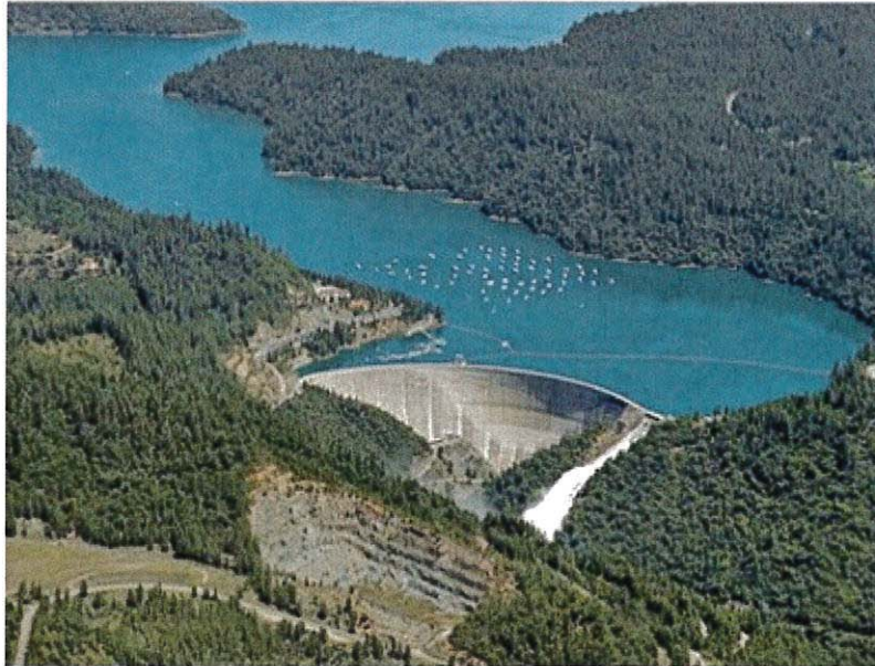
(2) Daguerre Point Dam