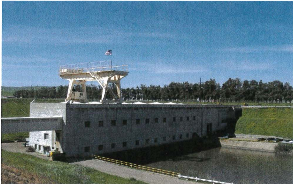
(6) Freeport Regional Water Project intake on the Sacramento River