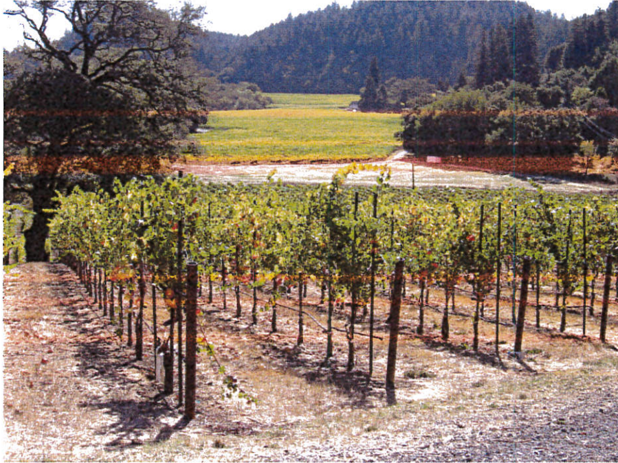
Typical Place of Use