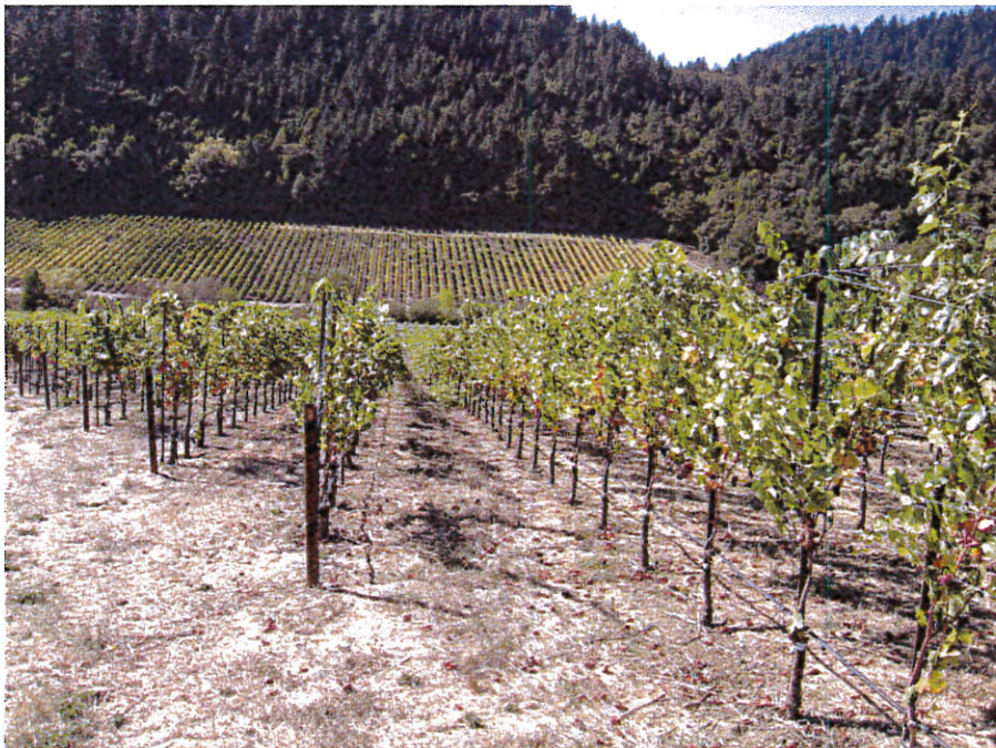
Typical Place of Use