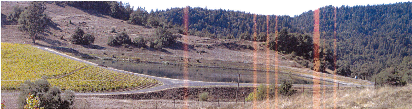
Offstream pond "A"