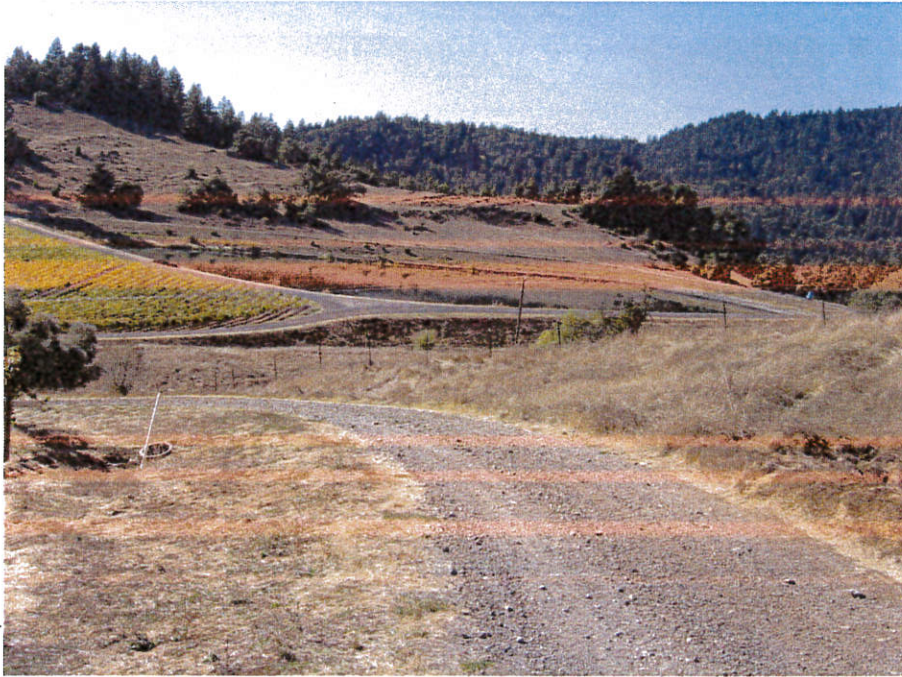
Offstream pond "A"