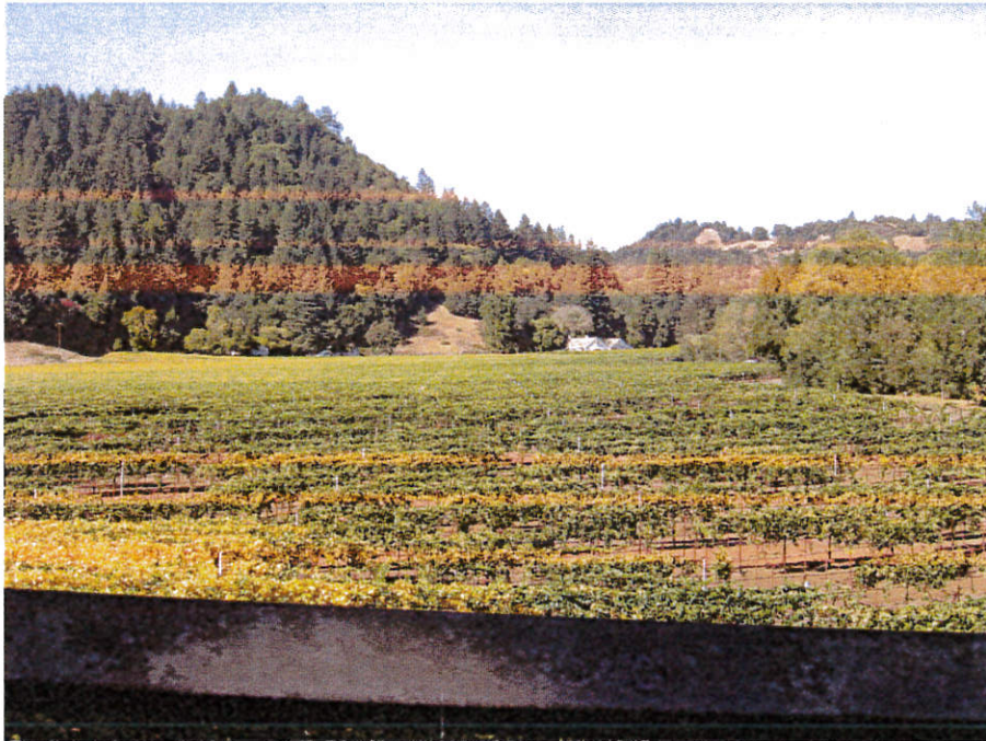
Typical Place of Use