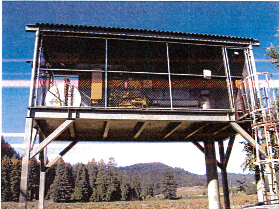
Point of Diversion #1 - Russian River Pump