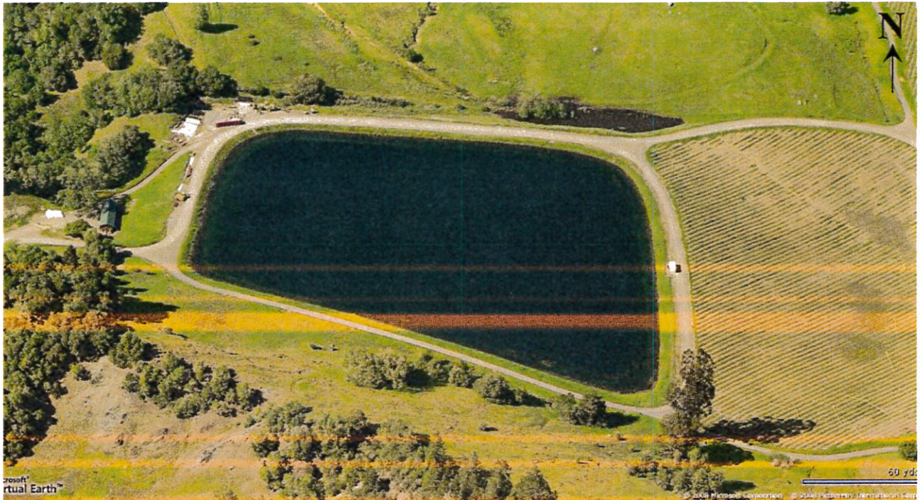
Reservoir on Gallo Glass Co. parcel 110-200-002-000