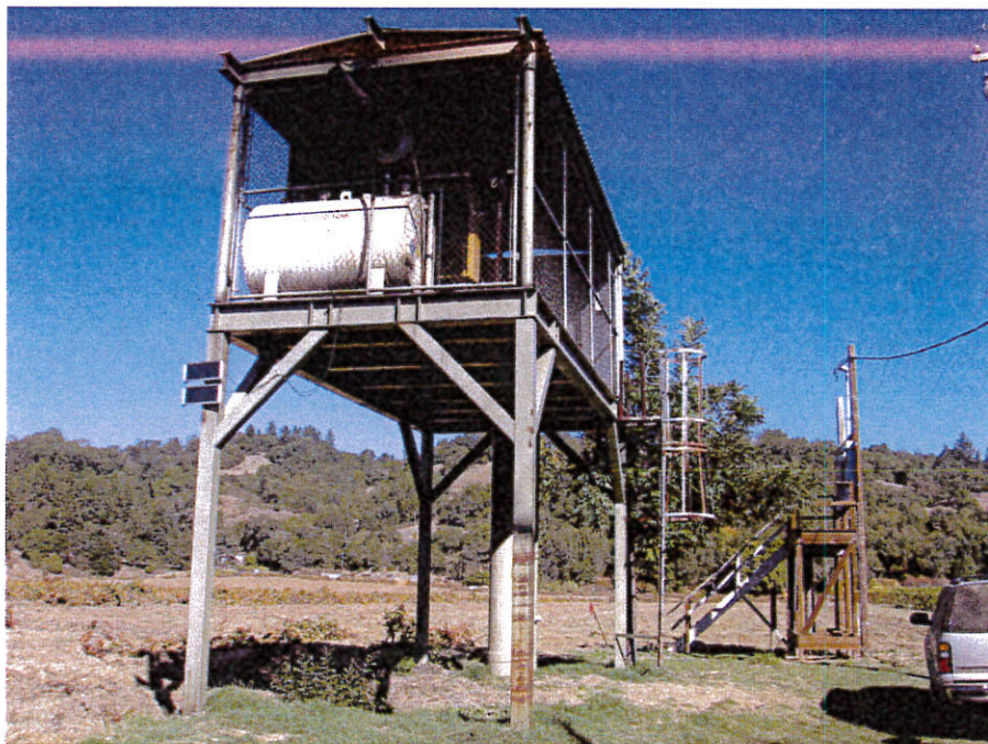
Point of Diversion #1 – Russian River Pump