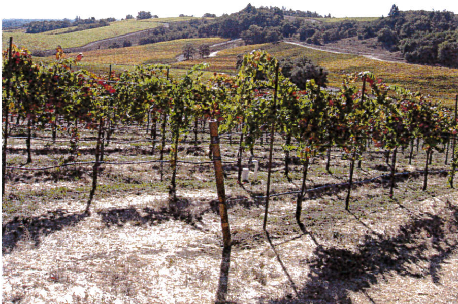
Typical Place of Use