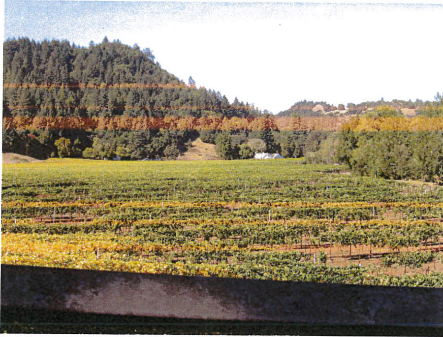
Typical Place of Use