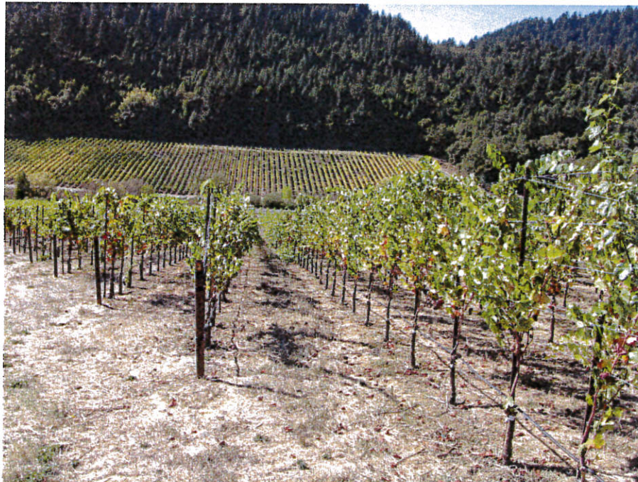
Typical Place of Use