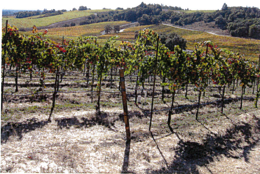
Typical Place of Use