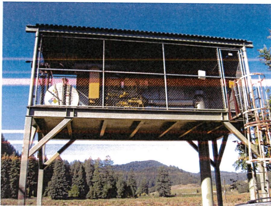
Point of Diversion #1 - Russian River Pump