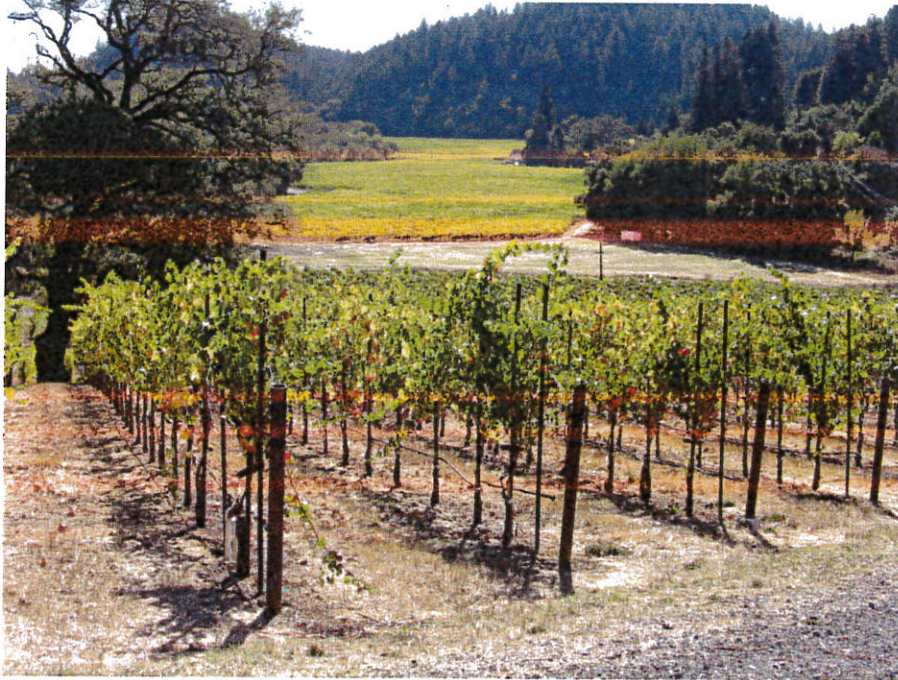
Typical Place of Use