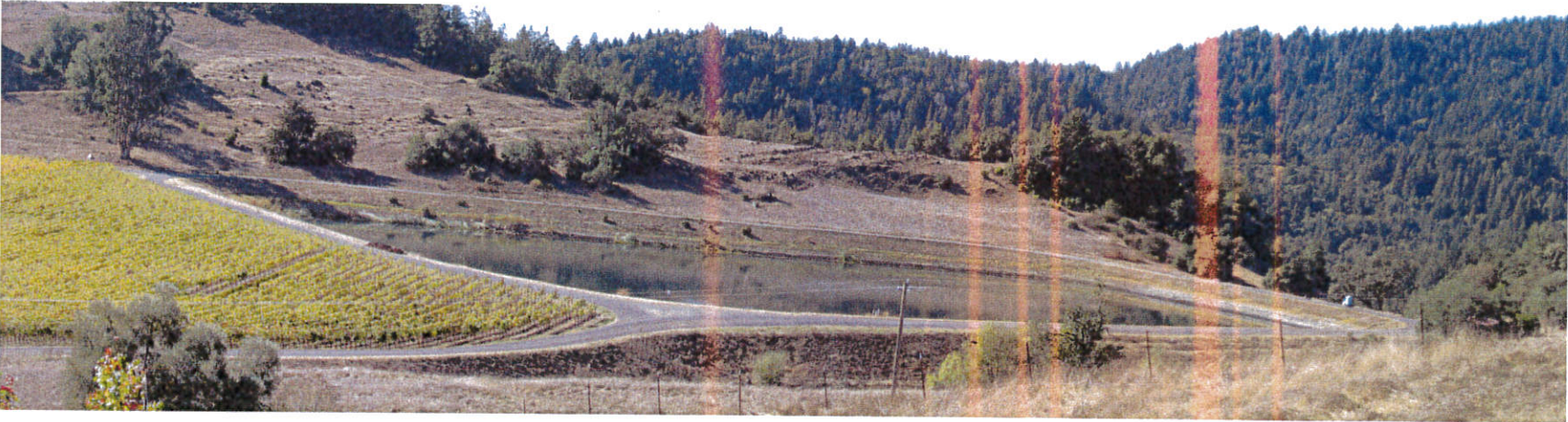
Offstream pond "A"