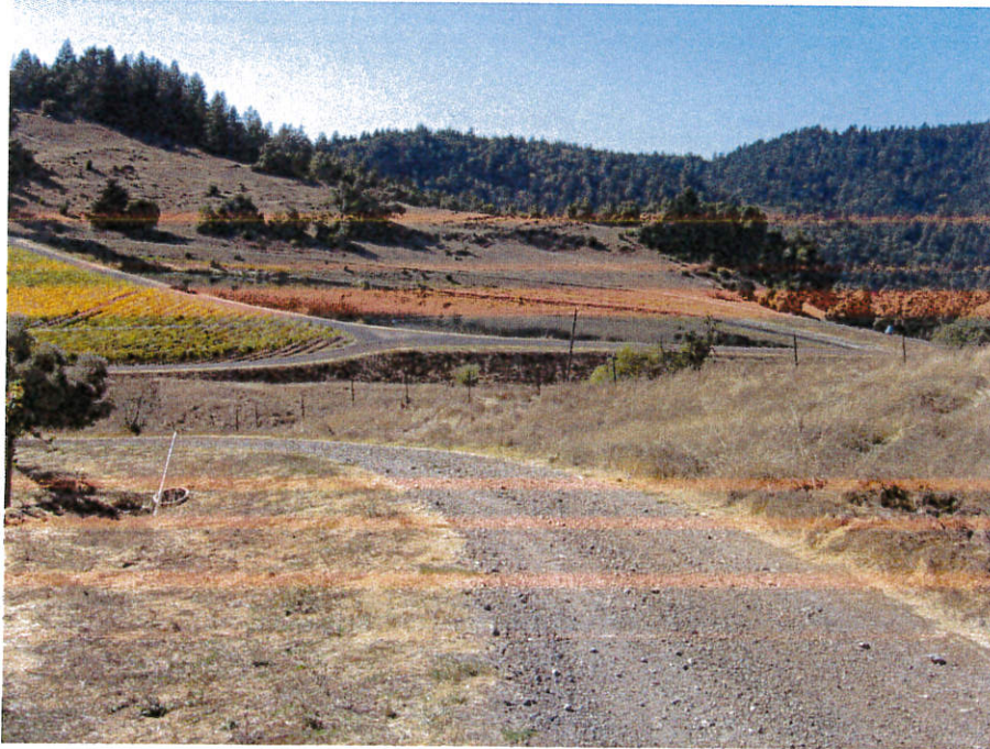
Offstream pond "A"