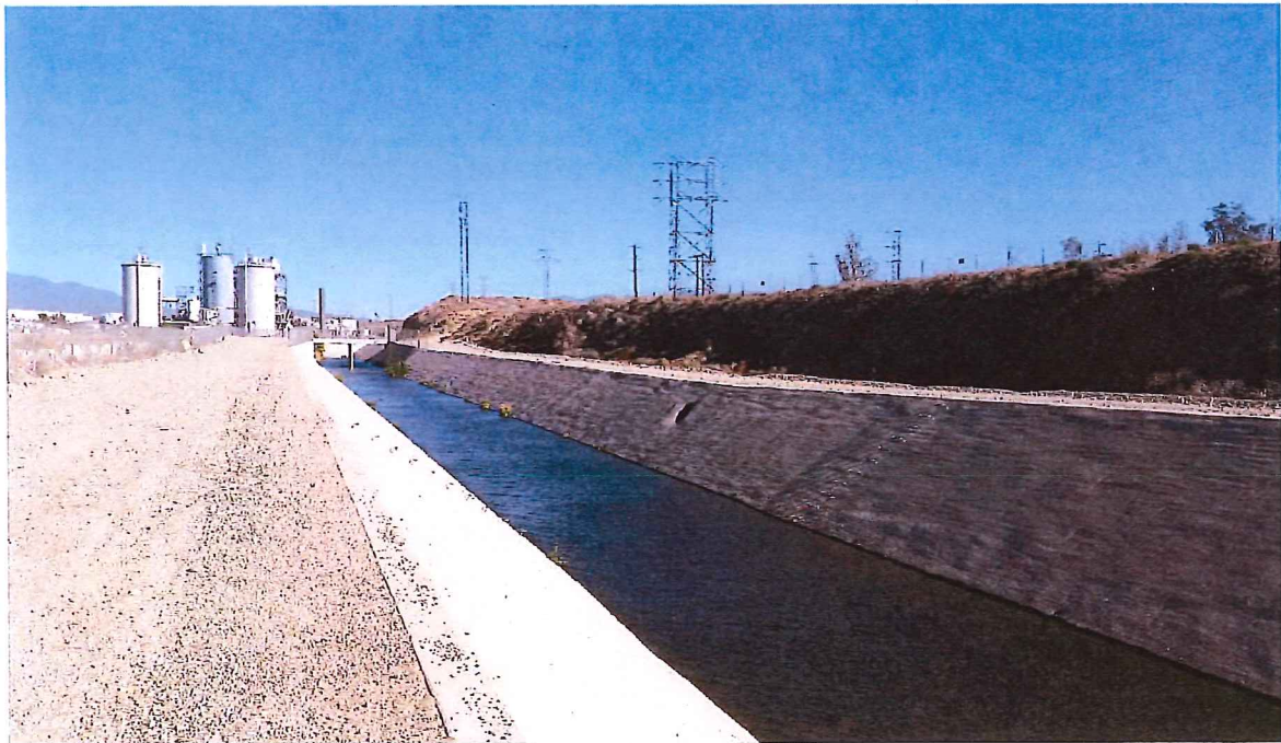
TOP IMAGE: CONCRETE-LINED CHANNEL IMMEDIATELY DOWNSTREAM OF RIALTO WWTP POINT OF DISCHARGE FACING DOWNSTREAM