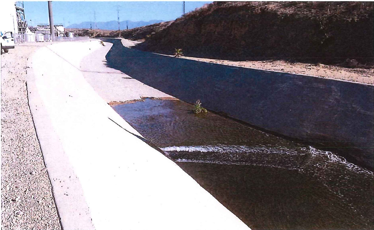
TOP IMAGE: AREA IMMEDIATELY UPSTREAM OF RIALTO WWTP POINT OF DISCHARGE FACING DOWNSTREAM (SOUTH) BOTTOM IMAGE: POINT OF VIEW AT RIALTO POINT OF DISCHARGE FACING UPSTREAM (NORTH)