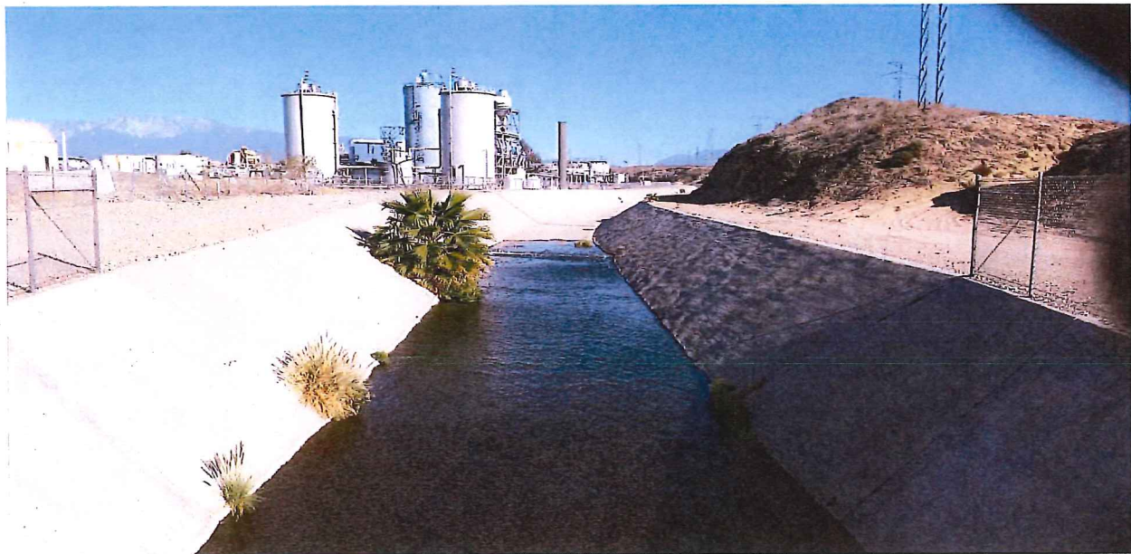
TOP IMAGE: RIALTO WWTP POINT OF DISCHARGE FACING UPSTREAM (NORTH) BOTTOM IMAGE: AREA IMMEDIATELY DOWNSTREAM OF RIALTO WWTP FACING UPSTREAM (NORTH)