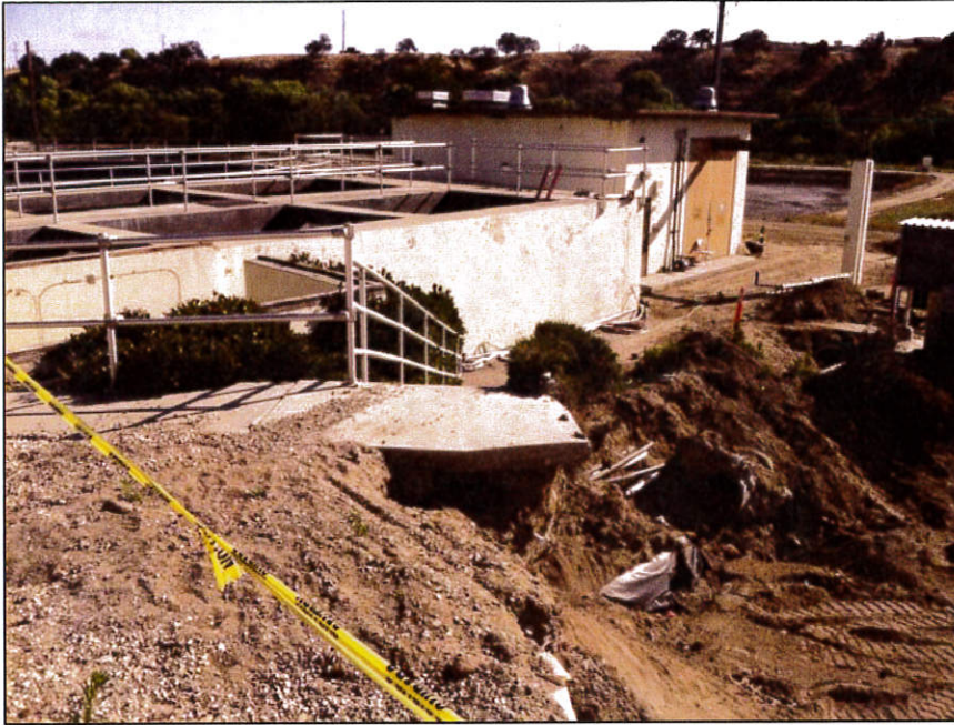
PHOTO 3: View of northeast corner of primary construction site within recently disturbed developed habitat within the existing WWTP footprint.