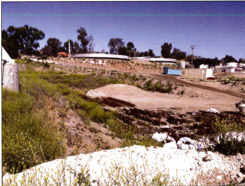
PHOTO 4: View of existing WWTP Pond No. 1 and proposed location for recycled water storage pond and pump within the existing WWTP footprint.