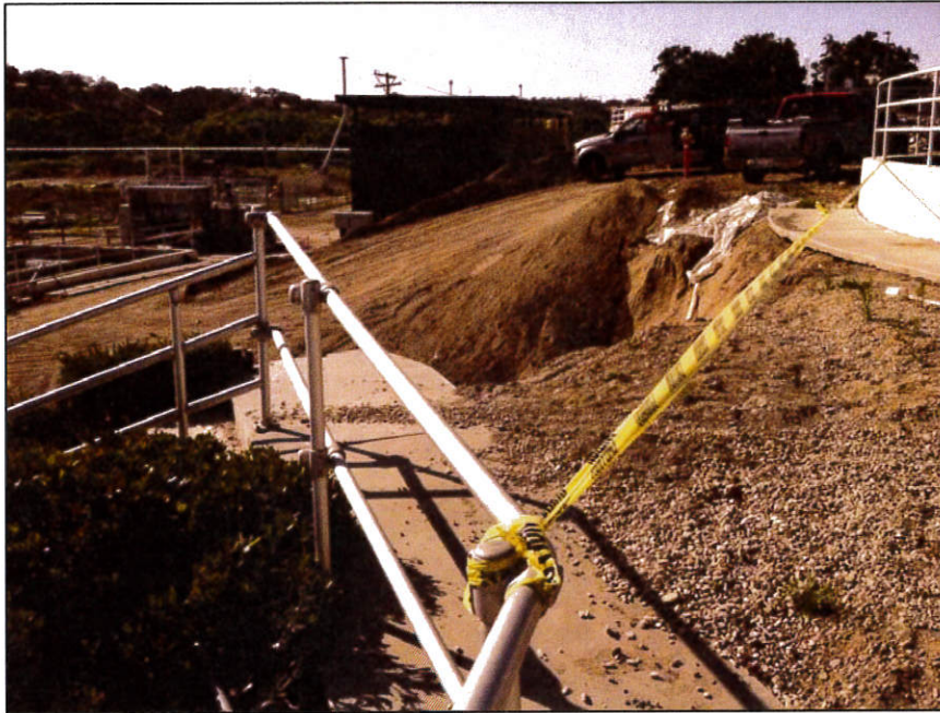
PHOTO 7: View of proposed location for new retaining wall, facing south within the existing WWTP footprint.