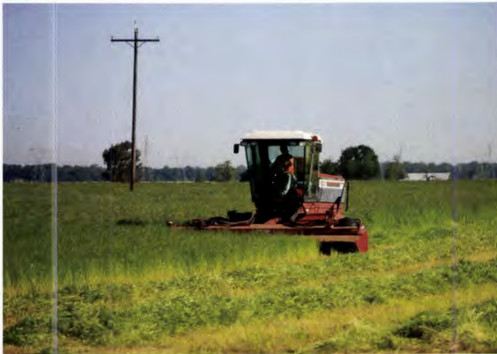
Representative irrigated land Date Unknown