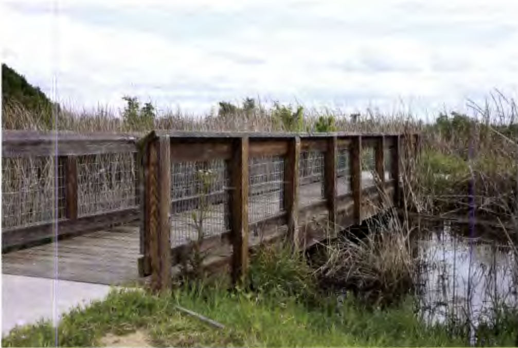
Representative Stone Lakes National Wildlife Refuge March 2015