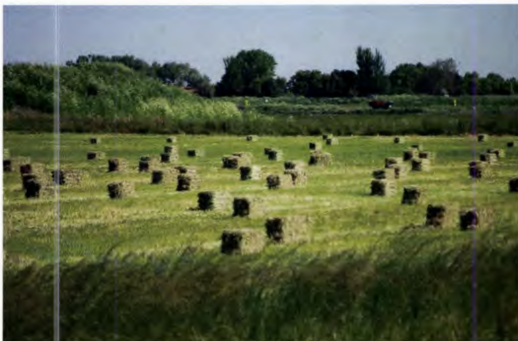
Representative irrigated land Date Unknown