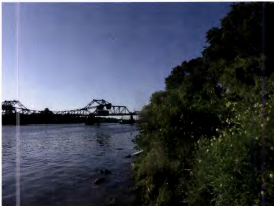
Sacramento River immediately upstream of the point of discharge July 2016