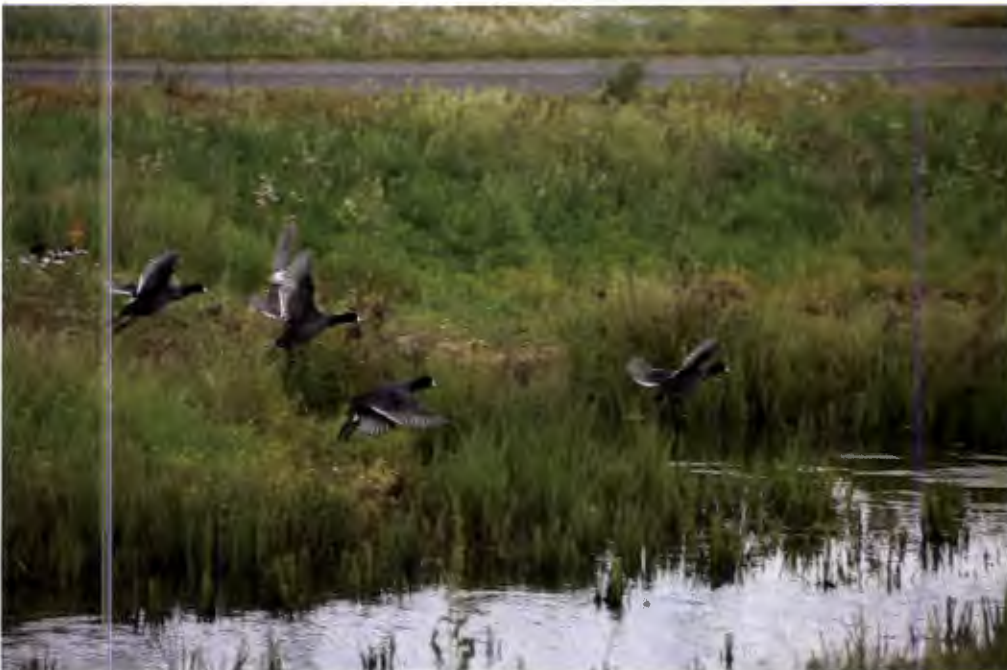
Representative Stone Lakes National Wildlife Refuge March 2015