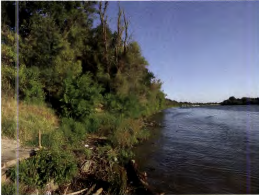
Sacramento River immediately downstream of the point of discharge July 2016

Photographs of the Existing Point of Discharge (See Attachment 2 for map showing location)