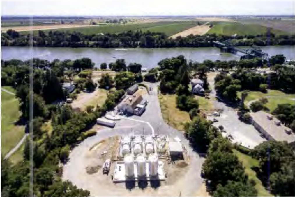
Aerial view of Sacramento River at the point of discharge with upstream to the right and downstream to the left (i.e., river flows from right to left in the photograph) July 2016