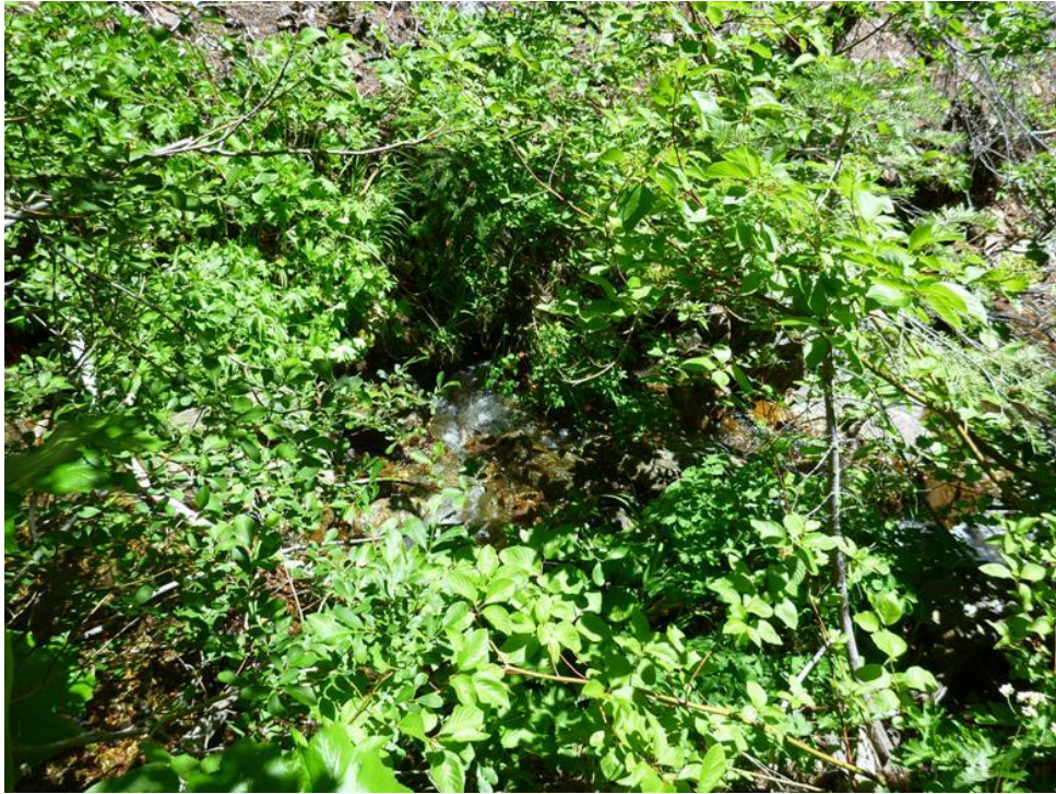
Figure 4. Cody Creek downstream of diversion point, within the instream flow dedication reach. (June 28. 2013)