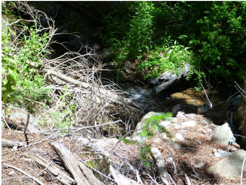
Figure 2. Cody Creek just upstream of diversion point. (June 28. 2013)