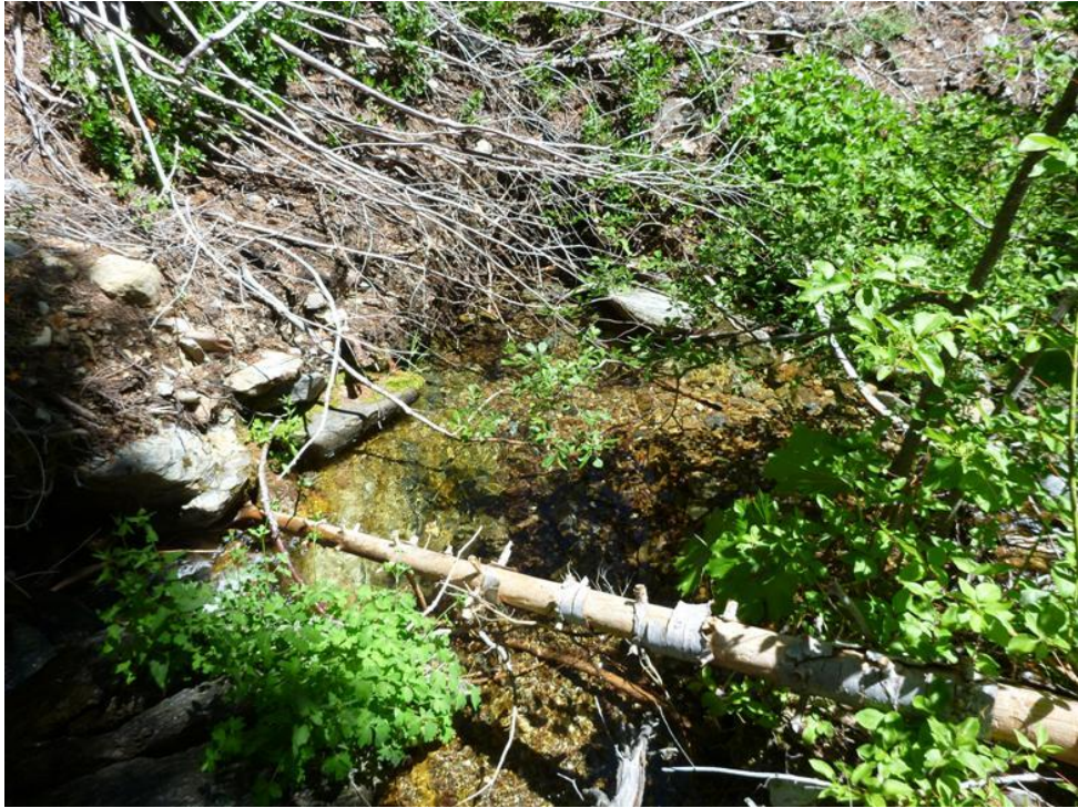
Figure 3. Cody Creek where diversion was located. (June 28. 2013)