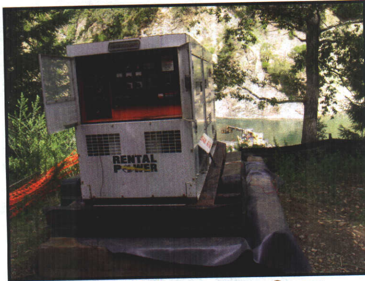
Figure 5: Generator Power Source