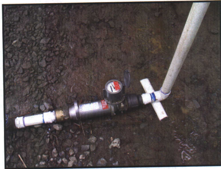
Figure 6: Flow Meter