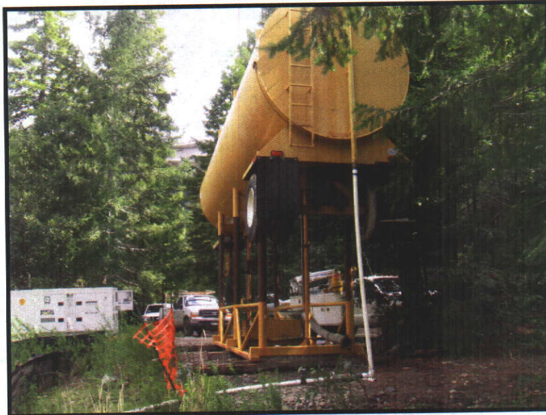
Figure 1: Typical Water Storage Tank w/PVC Line