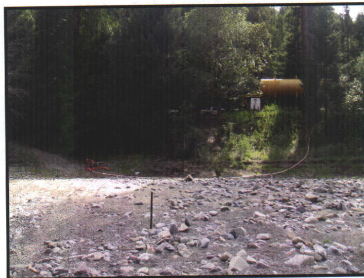
Figure 2: Temporary Storage of water drafting equipment