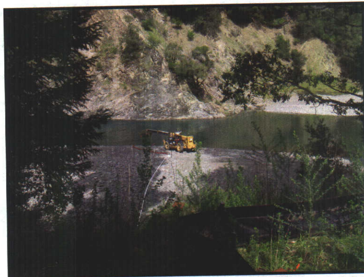
Figure 4: Placement of pump and filter at POD 1