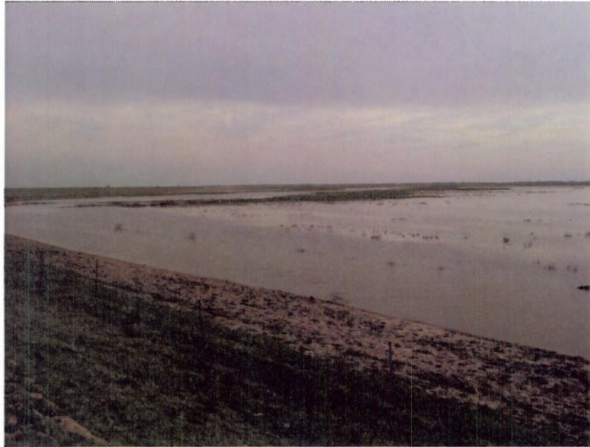
East Bear Creek Unit of San Luis National Wildlife Refuge - new place of use Photograph taken 4/20/2010