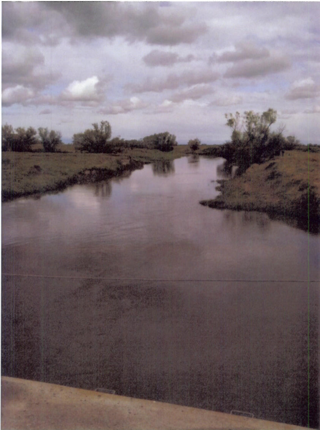
Bear Creek looking upstream from new point of diversion Photograph taken 4/20/2010