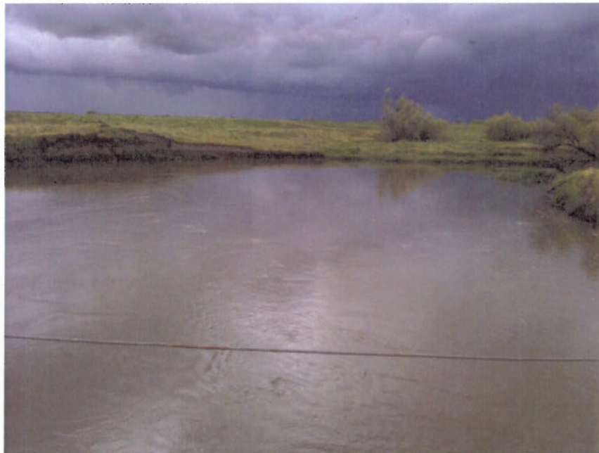
Bear Creek looking downstream from new point of diversion. Photograph taken 4/20/2010