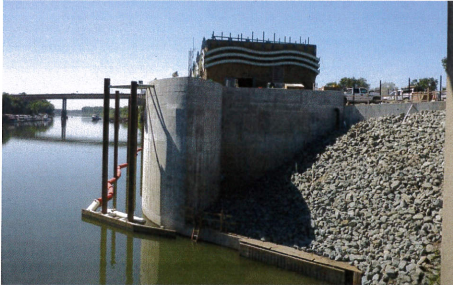
View of the new joint intake facility facing south (downstream) from the existing RD 2035 intake (June 28, 2016)