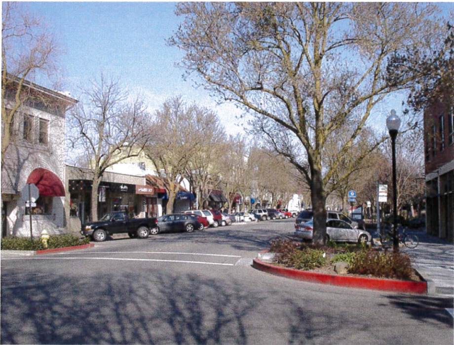
City of Davis (representative)