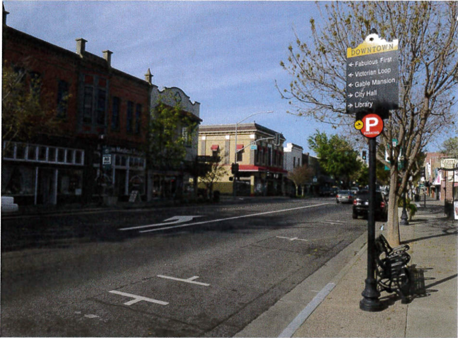
City of Woodland (representative)