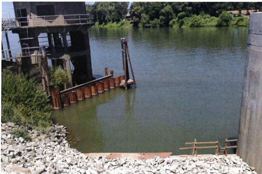
View of the existing RD 2035 intake facing north (upstream) from the joint intake facility (July 12, 2016)