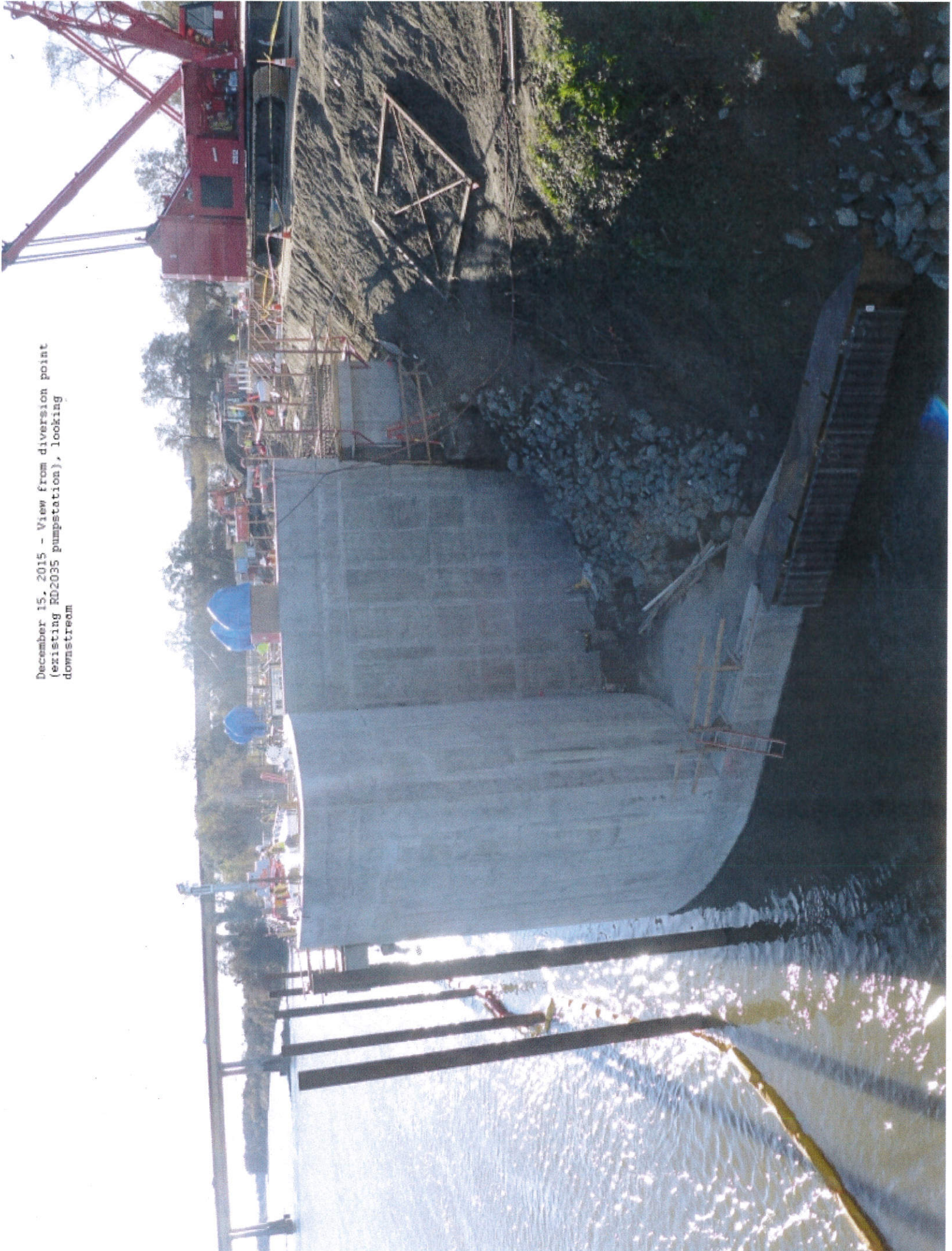
December 15, 2015 - View from diversion point (existing RD2035 pumpstation), looking downstream