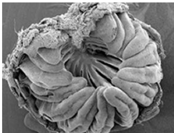
ROSY. This rosette, from inside the nostril of a coho salmon, contains the odor-sensory neurons that various pollutants can impair.