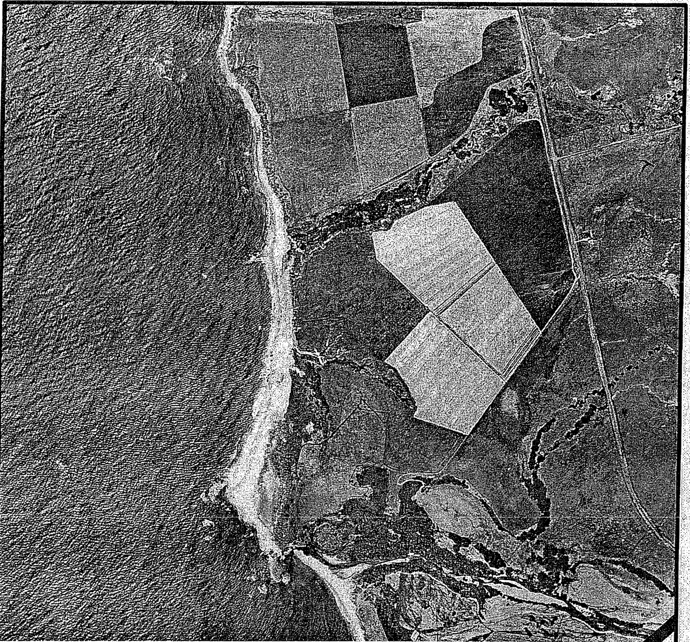
Photo Base: 14 May 1956 (1956-C), frame ABG-15R-22, original nominal scale 1:20,000, scale of figure 1:12,000.