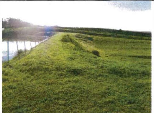
Photograph No. 6 Dam on reservoir.