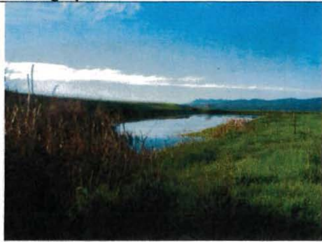
Photograph No. 1 North end of reservoir looking south.