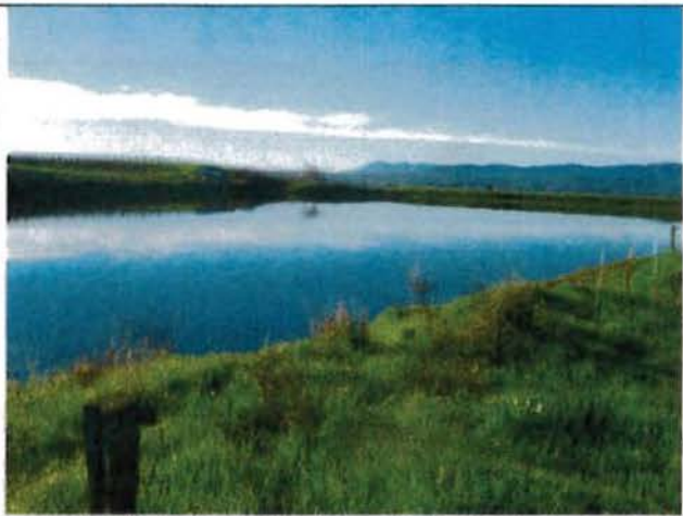
Photograph No. 3 Reservoir.