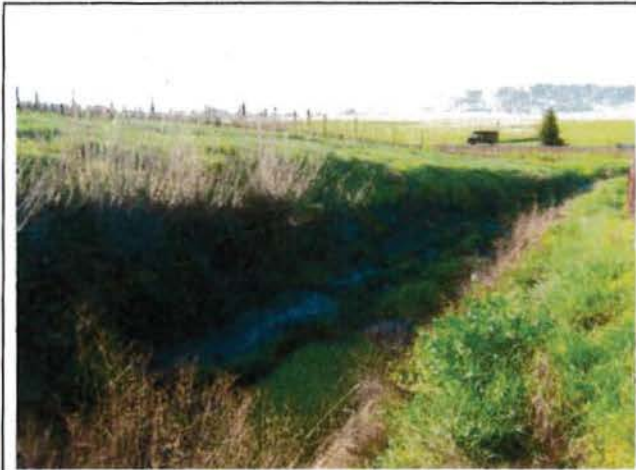
Photograph No. 9 Spillway downstream from reservoir.