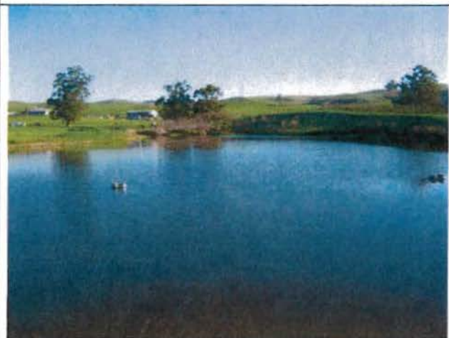
Photograph No. 7 Reservoir.