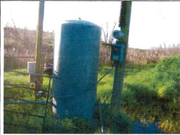
Photograph No. 5 Groundwater well next to reservoir. Per the owners' statements, groundwater from this well is not ever put into the reservoir.