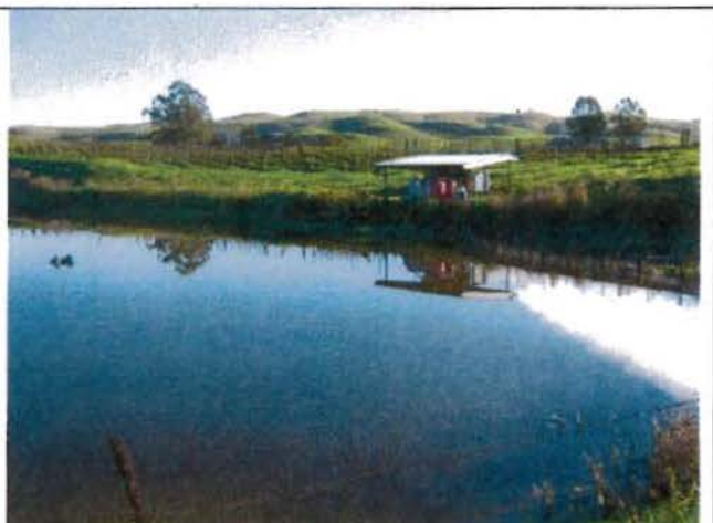
Photograph No. 8 Irrigation pumps that withdraws water from the reservoir to irrigate the vineyards. The owners said the irrigation pumps have 15 horsepower. Vineyard place of use in the background.