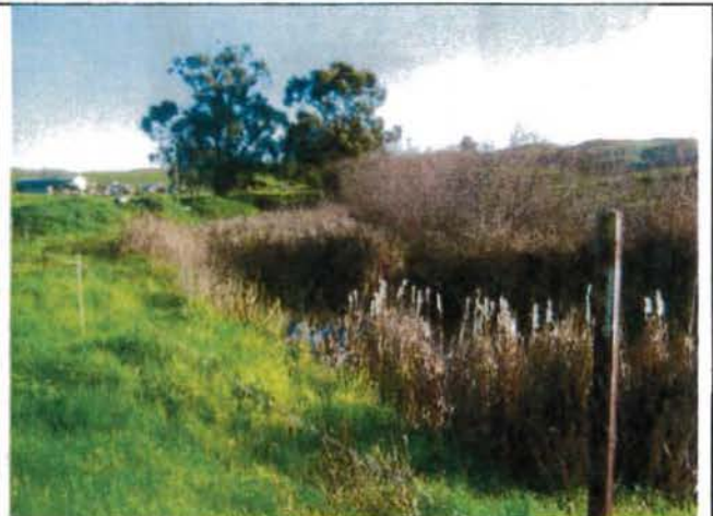
Photograph No. 2 Looking upstream at north end of reservoir.