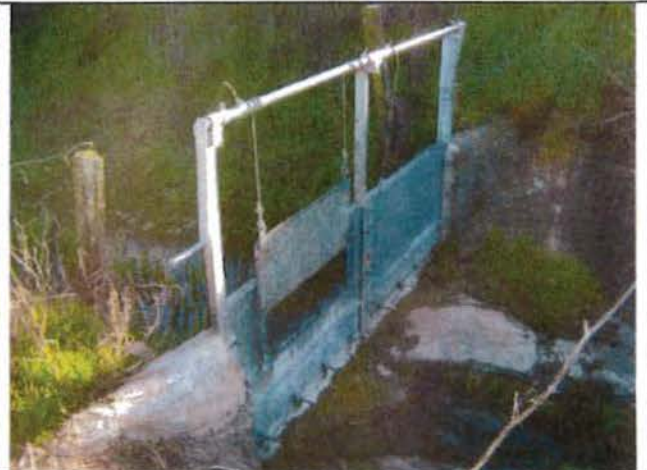
Photograph No. 10 Weir structure on spillway.