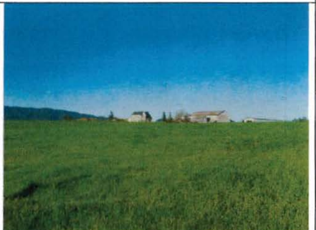
Photograph No. 4 Adjacent pasture that is irrigated with well water.