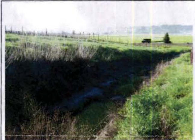
Photograph No. 9 Spillway downstream from reservoir.