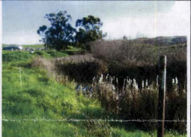
Photograph No. 2 Looking upstream at north end of reservoir.