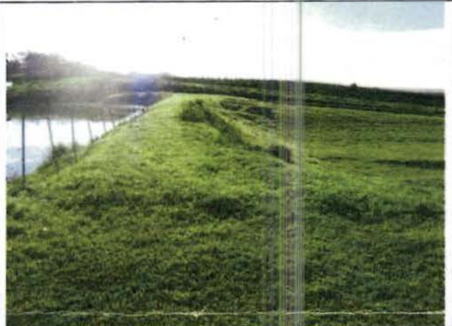
Photograph No. 6 Dam on reservoir.