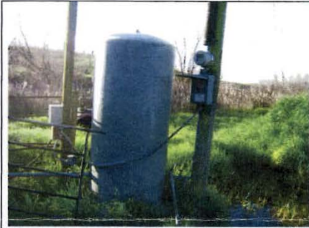
Photograph No. 5 Groundwater well next to reservoir. Per the owners' statements, groundwater from this well is not ever put into the reservoir.