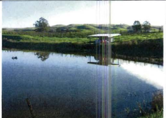
Photograph No. 8 Irrigation pumps that withdraws water from the reservoir to irrigate the vineyards. The owners said the irrigation pumps have 15 horsepower. Vineyard place of use in the background.