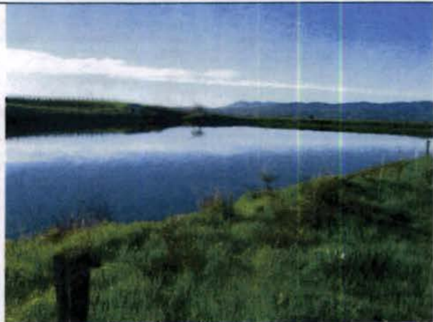
Photograph No. 3 Reservoir.