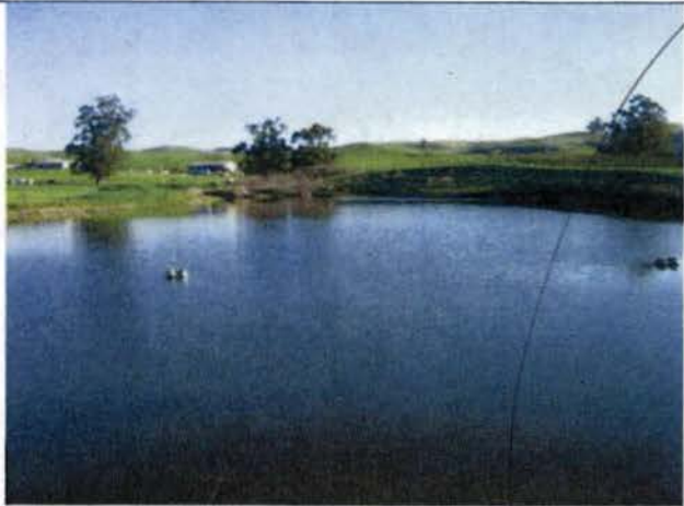
Photograph No. 7 Reservoir.