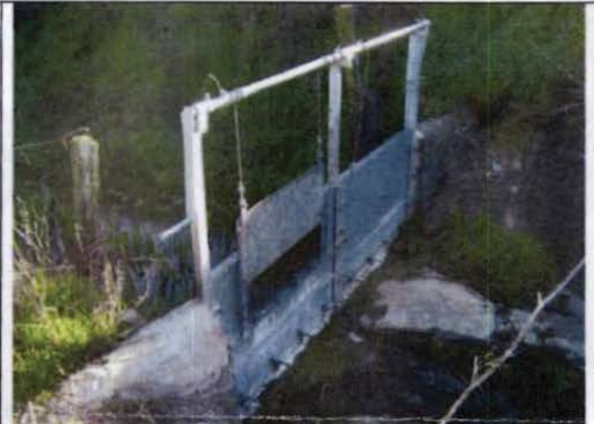
Photograph No. 10 Weir structure on spillway.