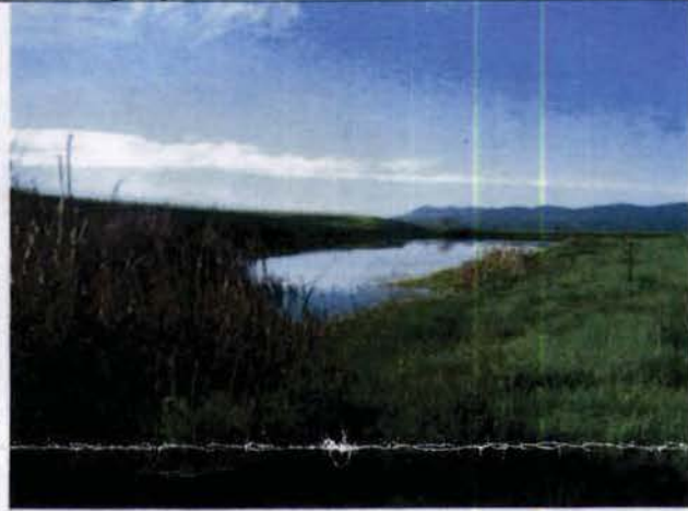
Photograph No. 1 North end of reservoir looking south.