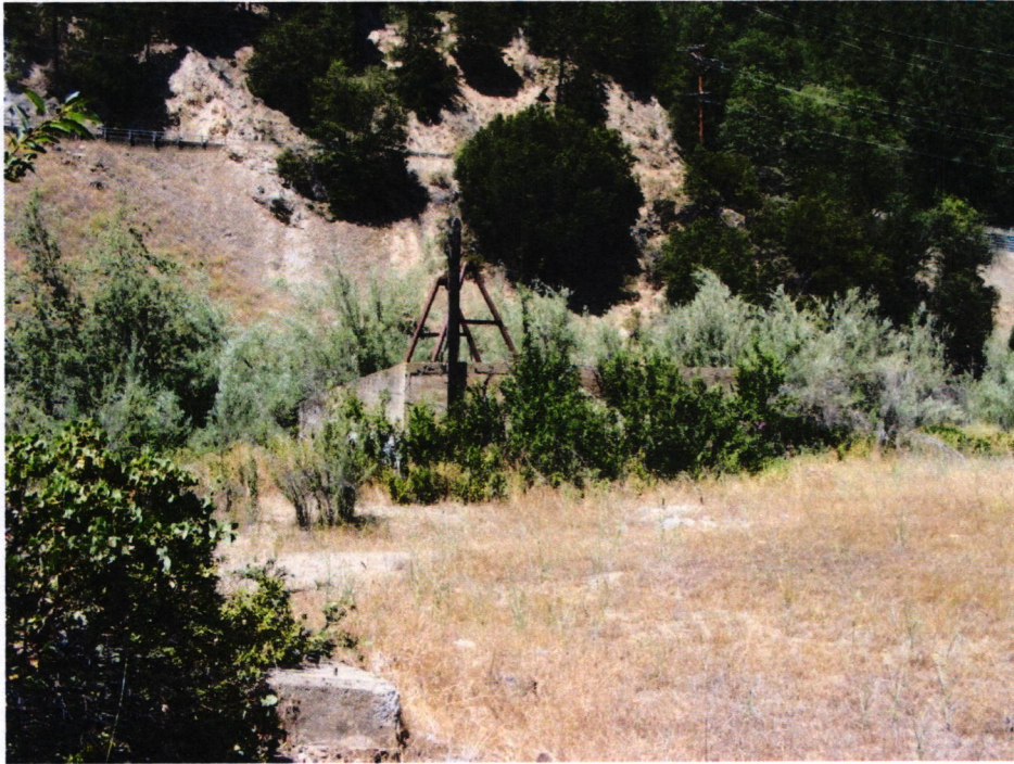
POD on East Branch of North Fork Feather River – POD not being used until development is determined for POU