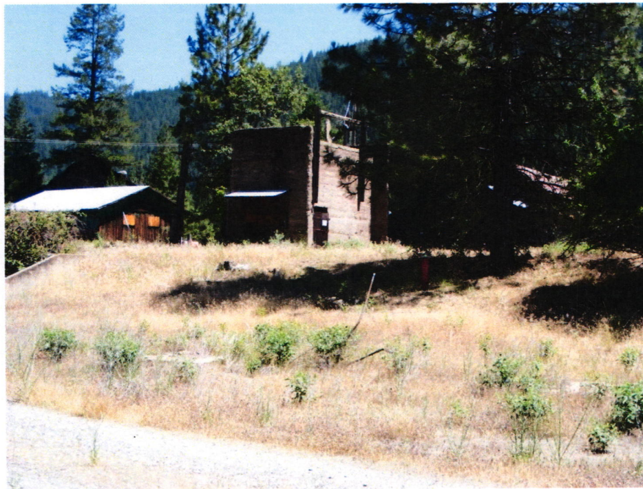
Abandoned lumber mill site POU