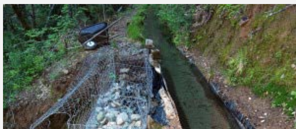
Gabion basket installation to repair canal berms at

Our first three years in our new home were spent cleaning up the land. We hired a scrap metal salvage firm to haul out seemingly endless amounts of old metal, and abandoned cars. The abandoned mining pit on the ranch was full of unlabeled barrels of agricultural chemicals and decades of accumulated household trash.