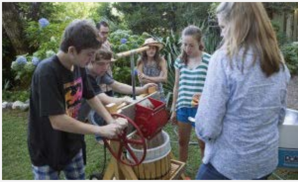
Making fresh apple cider with organic ranch apples and fruits

Blueberries, Raspberries, Strawberries, and thorn-less Blackberries as well as some more unique fruits such as Gogi Berries and Goose Berries. We also produce 6 varieties of grapes used for the table and for fresh cider. The other gardens and green houses produce every kind of vegetable imaginable. Fresh produce, garden to table, is the theme in our culinary offerings. The gardens are all fed with water that has passed thru the Hydro electric plant, doubling the use of the water that is drawn from the canal. Use of modern drip systems then make the gardens flourish with minimal water consumption.