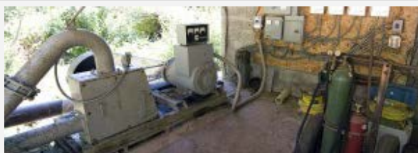
Hydro electric power plant at California's dude ranch

Some major changes that took place early on in the reformation were repairs to the historic water canal that carries water around the mountain to supply the ranch. The canal carries all the water needed for potable water consumption, agricultural needs, as well as generating power for the ranch. Marble Mountain Ranch is far removed from access to any public utilities and has, since it's inception, produced all needed electricity via a small hydro power plant.