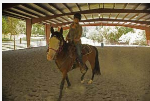
Horse Riders In A Covered Arena

1. Students feel more secure and willing to push the envelope in a more sheltered setting. They are more willing to move to the “next level” when there is a sense of more managed riding risk.