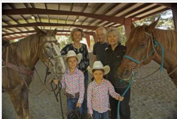
Grandparents, Parents, and children all gain from riding in a covered arena

the rider, and passively participate through the observation of a riding lesson.