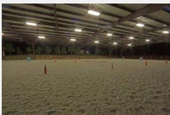
Indoor Arenas with overhead lighting allows night-time riding

5. Night time riding is enabled with the convenience of a lighted arena.