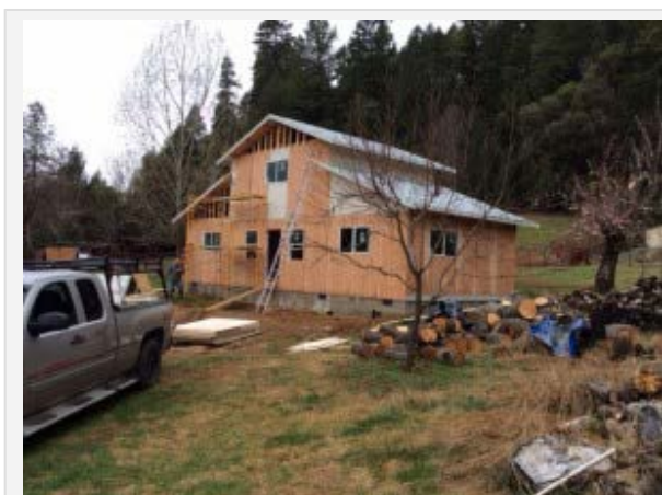
The "Hireling Habitat" – our cowboy's bunkhouse in the framing stage

Here is the new bunkhouse (we call it the peach-tree house) at it's framing stage.