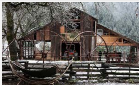
Hay Barn with wrangler habitat in loft

Here is a winter picture of our old hay barn with wrangler habitat in the upper loft: