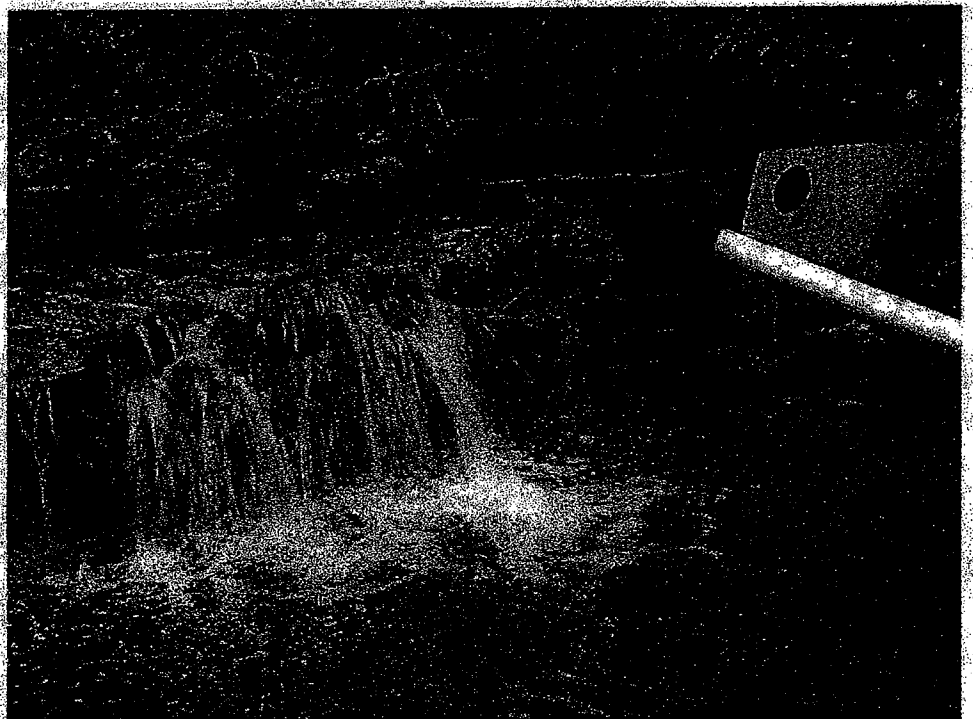
There was no measuring device at the point of diversion to verify the bypass. The gap in the structure was filled with wood pieces that appear to include the original measuring device.