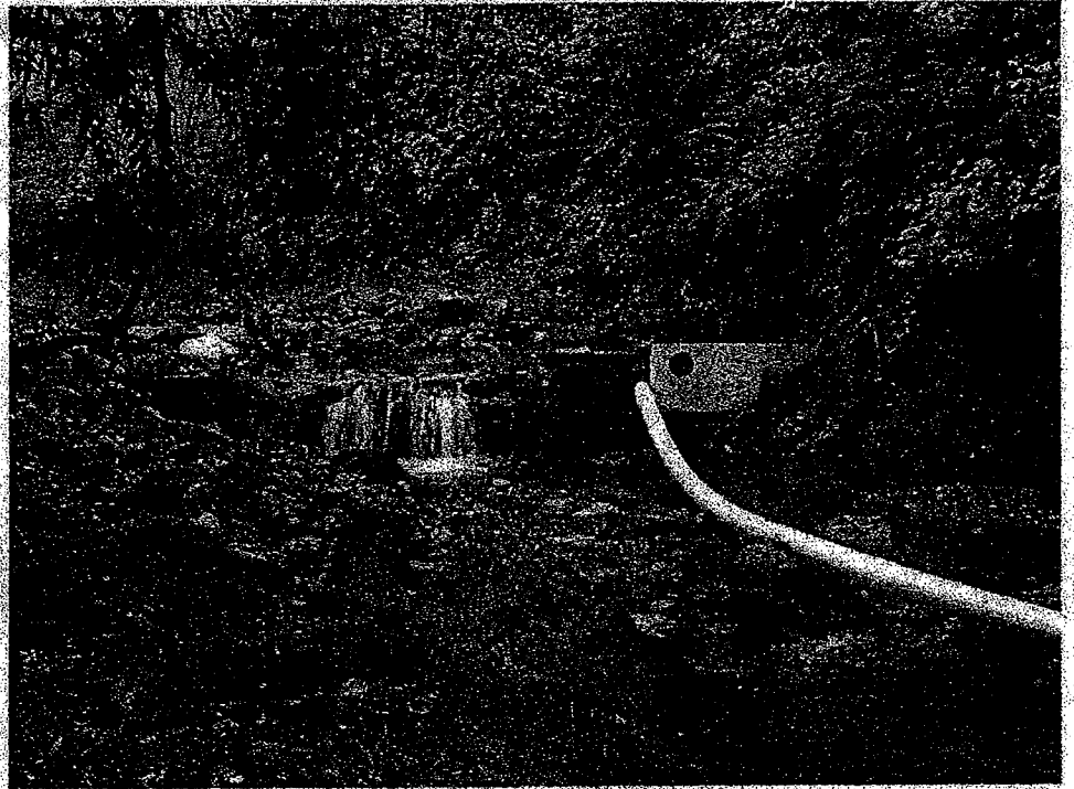
Diversion dam and 4-inch PVC pipe at the point of diversion to offstream storage.