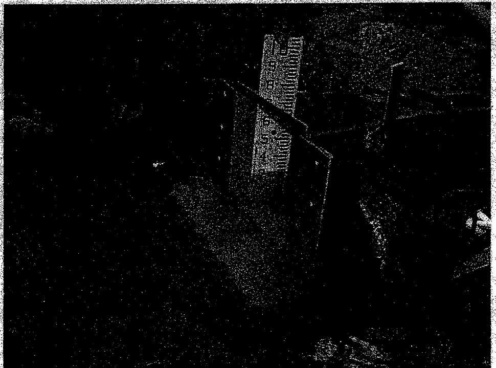
The depth of flow in the 3-inch Montana fume was 0.31 ft. This corresponds to about 0.16 cfs. ft.