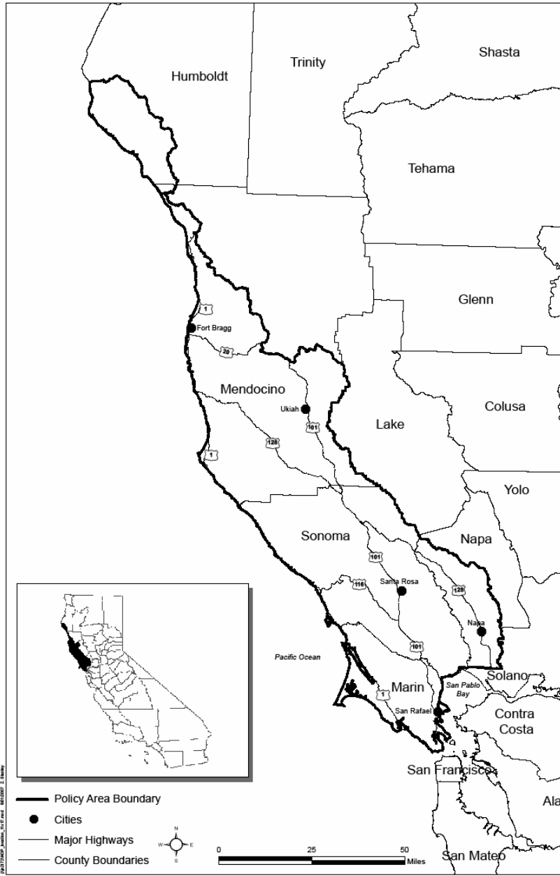
PROJECT LOCATION / POLICY AREA

Formatted: Left Formatted: Font: (Default) Times New Roman