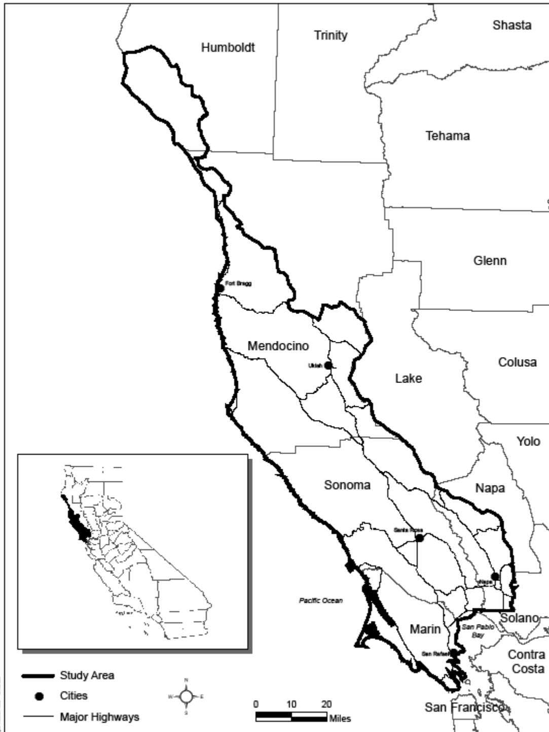
Figure 1-1. Policy Area