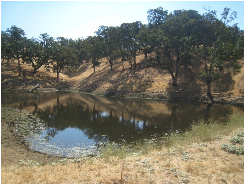
Figure 2: Rancho Cañada de Pala Preserve Stockpond # 6