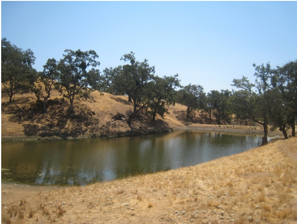
Figure 1: Rancho Cañada de Pala Preserve Stockpond # 5