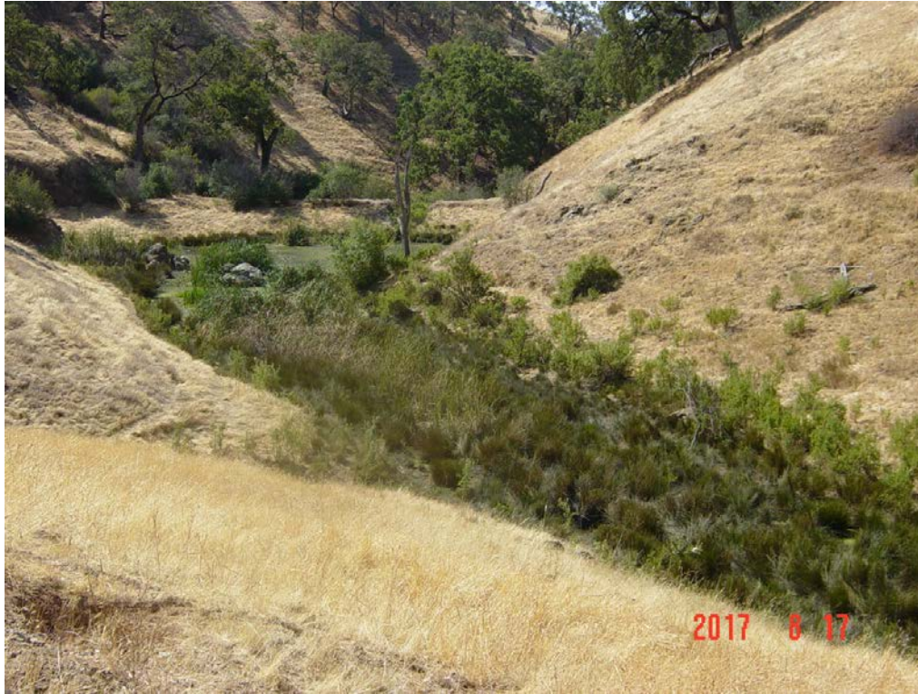
Figure 3: Rancho Cañada de Pala Preserve Stockpond # 8