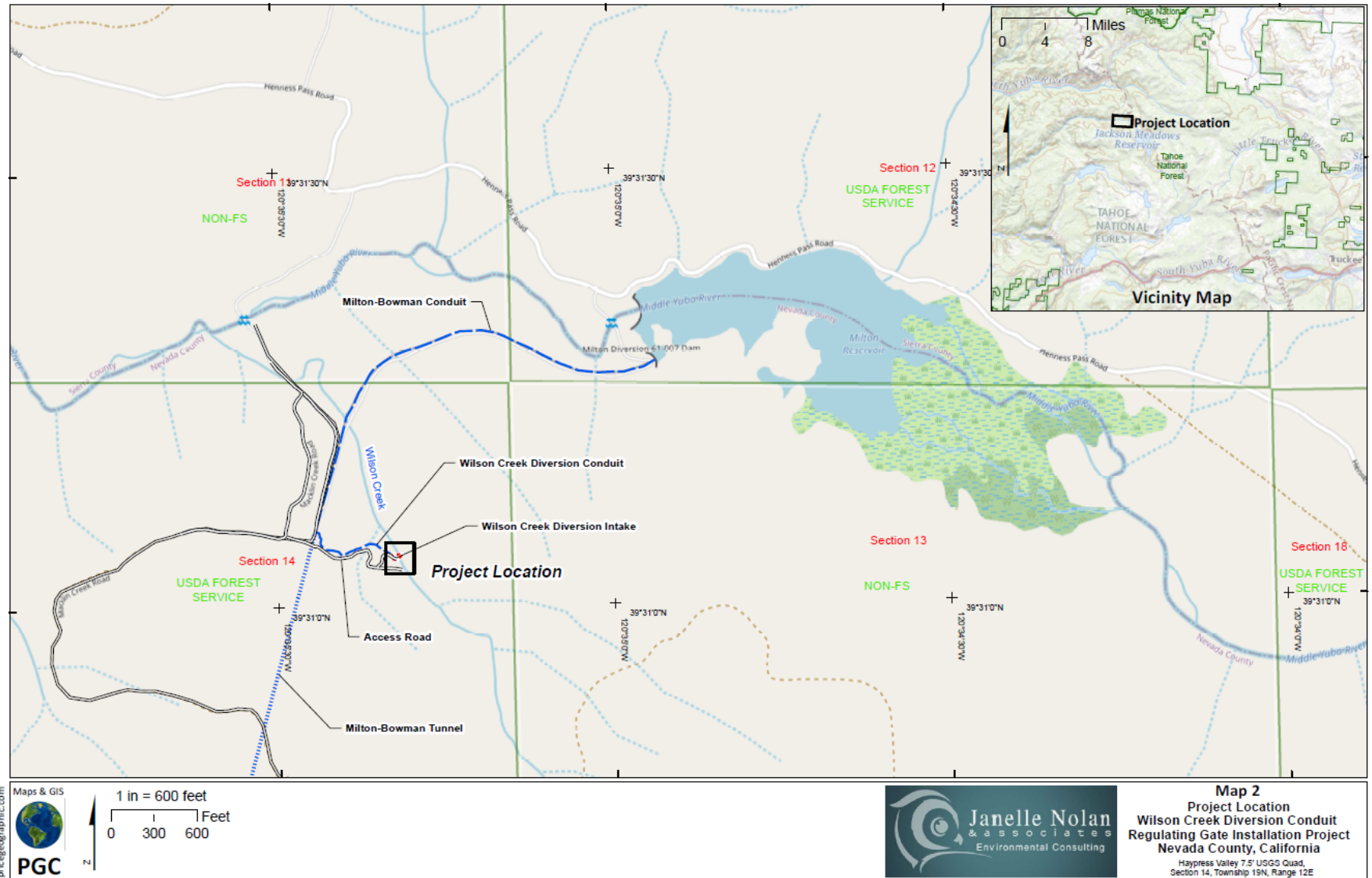
Figure 2. Project Location: Wilson Creek Diversion Conduit Regulating Gate Installation Project