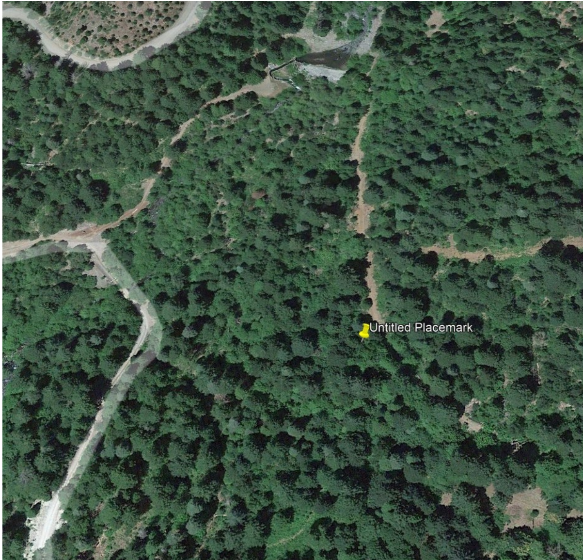
Figure 2. Nelson Creek Upland Location for Infiltration