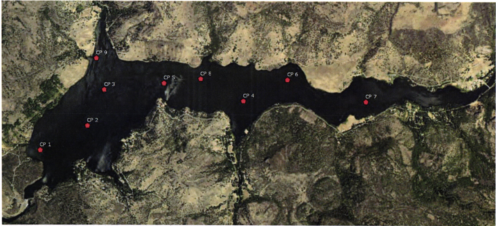
Figure 4. Copco Reservoir Sediment Grab Sample Locations