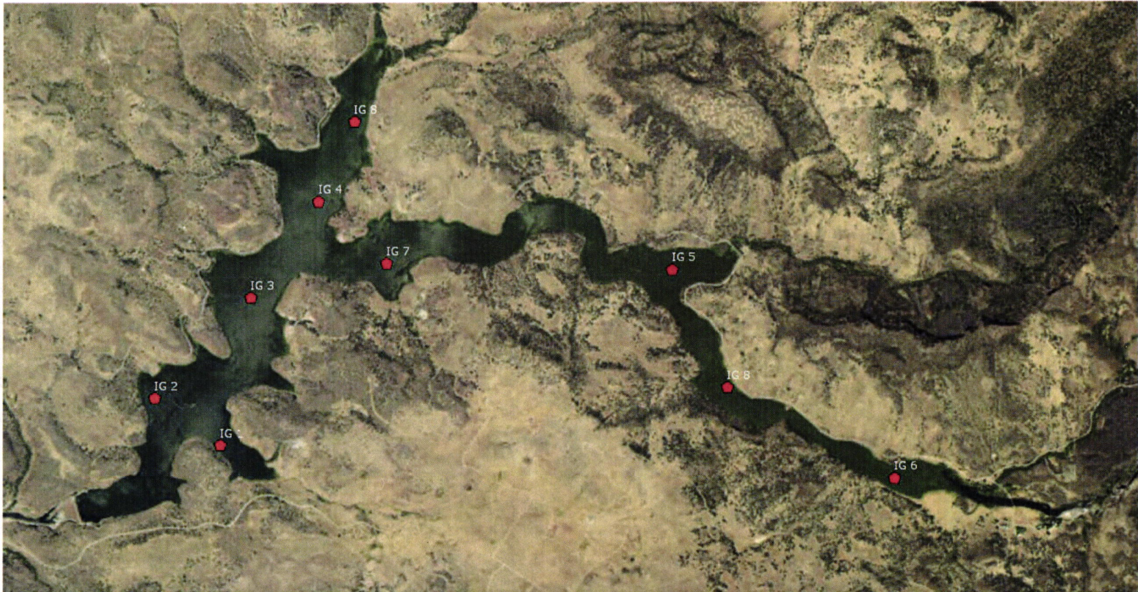
Figure 5. Iron Gate Reservoir Sediment Grab Sample Locations