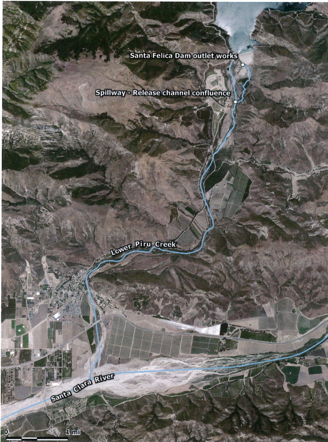
Figure 1: Overview of Project area.